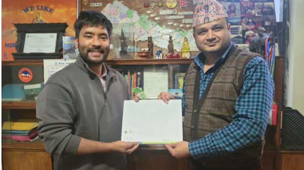
Figure 3: Agreement with Doko Recyclers for office waste management

We partnered with Doko Recyclers to manage our office waste responsibly. This ensures paper, plastic, and other recyclables are properly collected and processed, reducing our environmental impact and supporting sustainable waste management in Nepal.