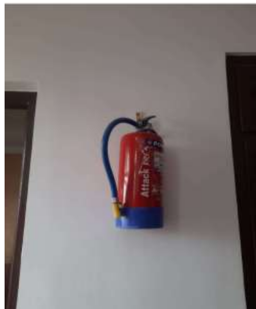
Figure 9: Fire Extinguisher – For Emergency Use