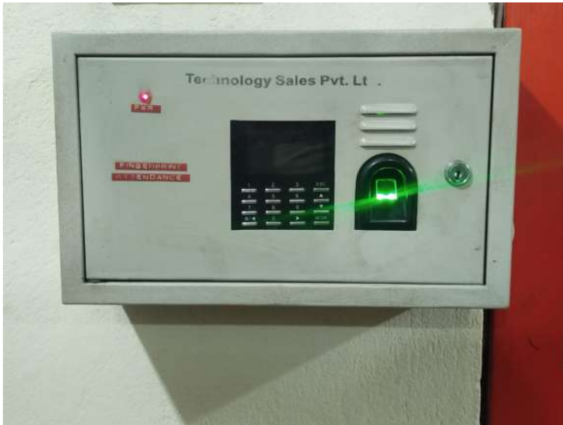
Figure 11: Office Attendance System