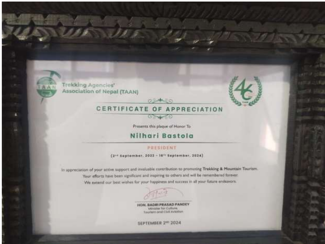
Figure 8: In Appreciation of Our CEO