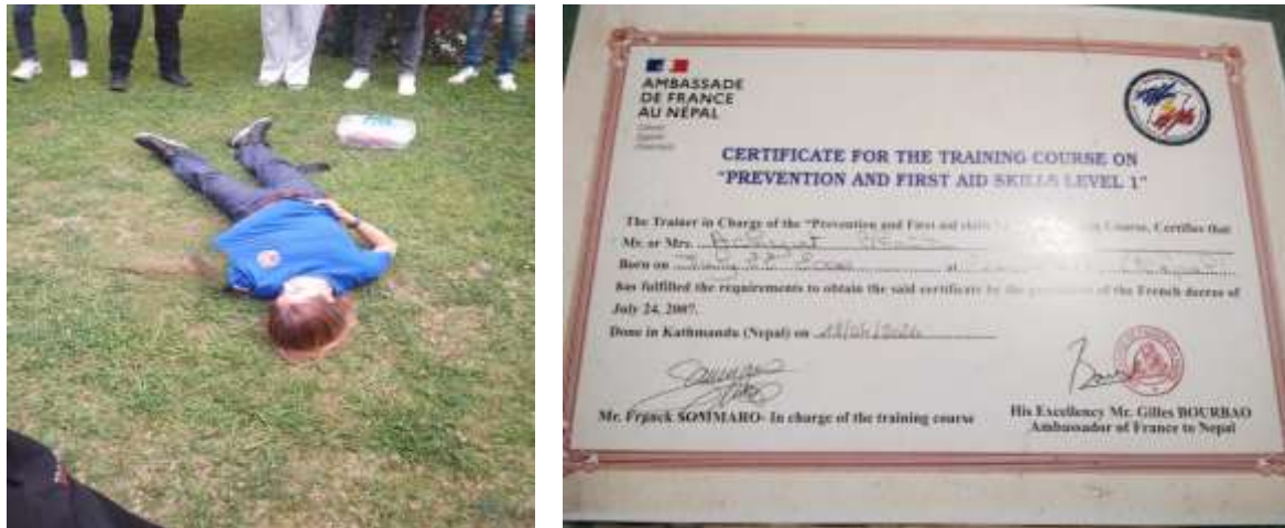
Figure 6: First-aid training session and certificate awarded

We provided first-aid, safety, sustainability, and Travelife training to our staff and guides, along with special courses for our drivers. This helped our team work safely, respond in emergencies, and promote sustainable practices during our tours.