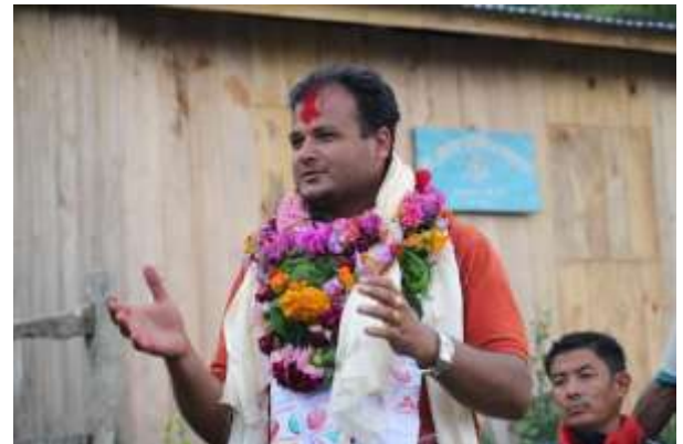
Figure 1: Asian Heritage Foundation CEO with schoolchildren, receiving their gratitude during stationery distribution