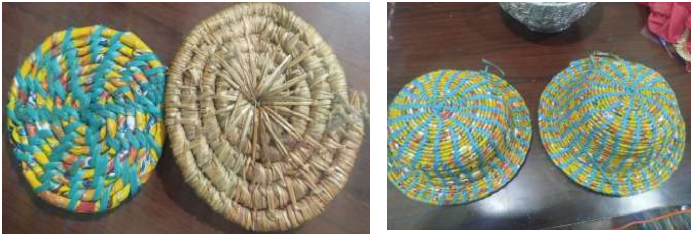
Figure 10: Product Made By Plastic Waste