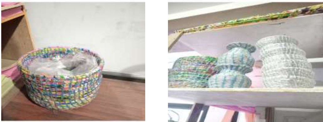
Figure 4: Repurposing plastic waste into useful office items

In our office, we reduced plastic waste by turning it into useful items like waste bins and tea mats. This approach cut down on waste, encouraged recycling, and promoted sustainability in our daily work.