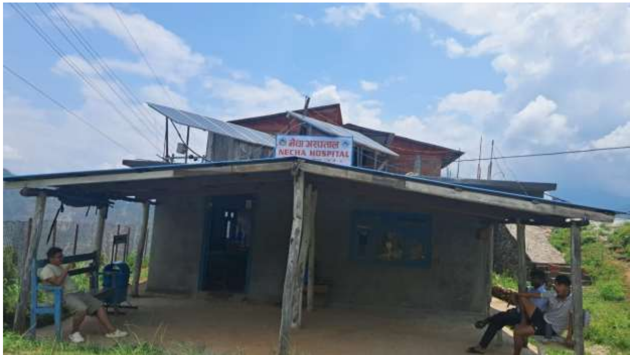
Figure 14: Hospital building supported by the Asian Heritage Foundation Nepal