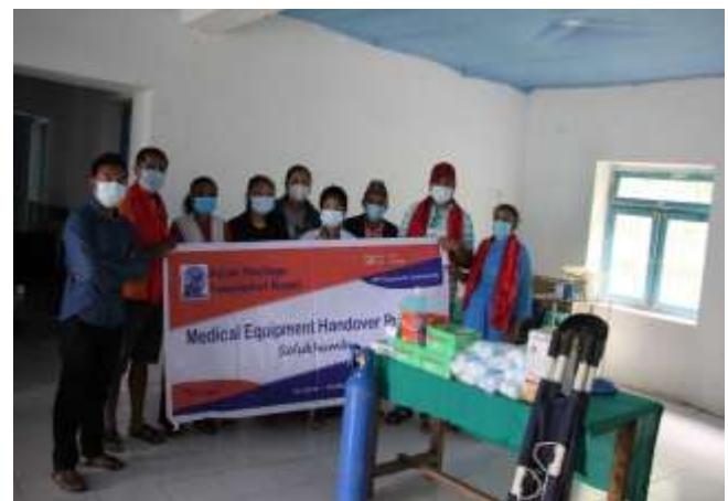
Figure 2: Distribution of medicines and equipment to Necha Community Hospital